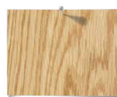
Cabot's Deck & Exterior Stain Golden Pine