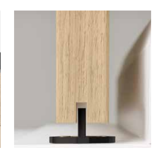
Floor Mounted Door Guide.

To keep your barn door on track and prevent it from swinging towards and away from the wall, we offer two types of door guides. The floor-mounted door guide comes standard as part of the hardware kit. If your floor is tile, cement, stone, marble or another hard surface that you would rather not drill into, the wall mounted door guide is another option. Equally as discreet, this easy-to-install hardware is sold separately in a matt black finish.