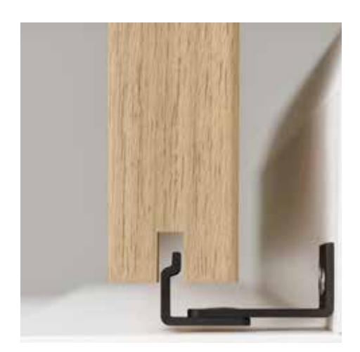
Wall Mounted Door Guide.